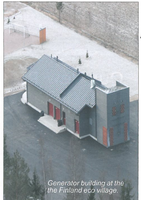
Generator building at the Finland eco village.